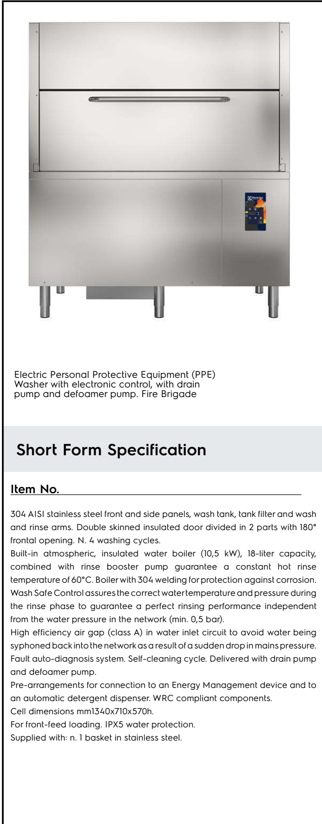
Electric Personal Protective Equipment (PPE) Washer with electronic control, with drain pump and defoamer pump. Fire Brigade